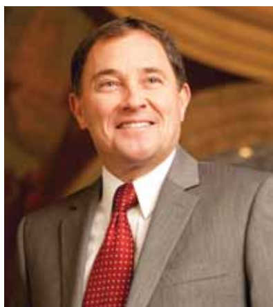
GARY R. HERBERT Utah Governor